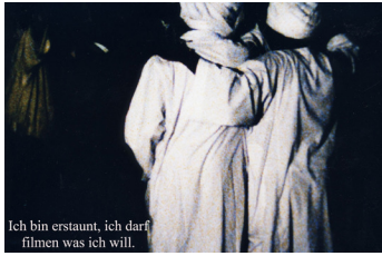
Phantom Fremdes Wien