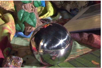
Imago Mundi all Stills © sixpackfilm