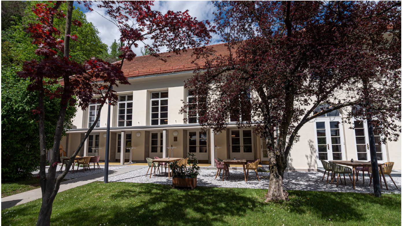
Heimatsaal im Volkskundemuseum

| Diagonale | Forum | at the Heimatsaal at Volkskundemuseum Paulustor