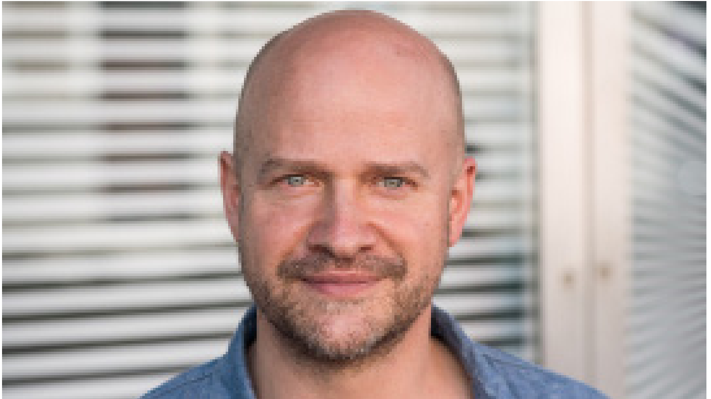
Lukas Miko