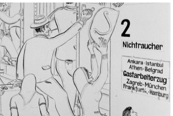
Gastarbeiter Trumbetaš © Zagreb Film