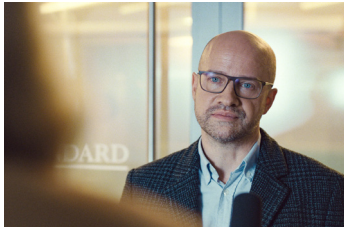
Persona Non Grata