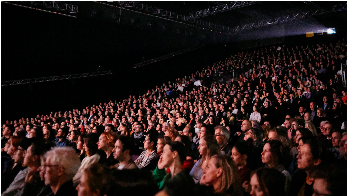
Diagonale '23-Eröffnung, Helmut List Halle