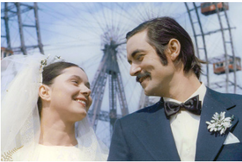
Wo sein Wäsche