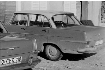
Halo, München