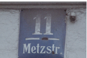
Inventur - Metzstraße 11