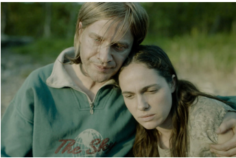
The Best of All Worlds