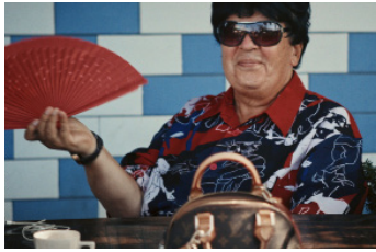
Liebe, D-Mark und Tod