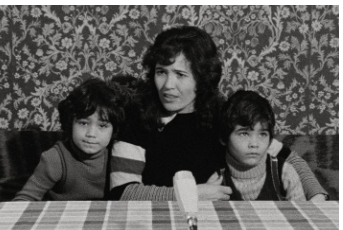
Analphabeten in zwei Sprachen